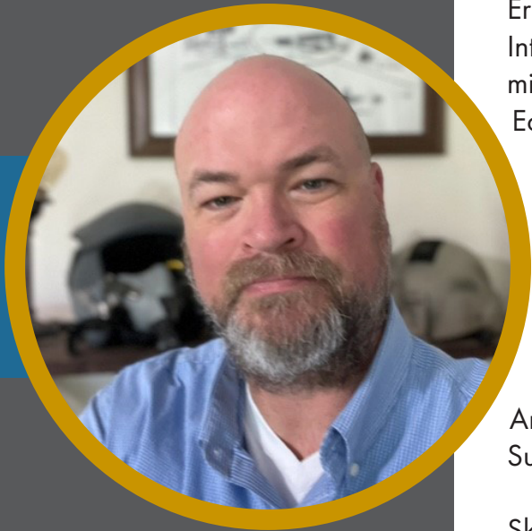
Presenter & Moderator CMSgt, USAF (retired)