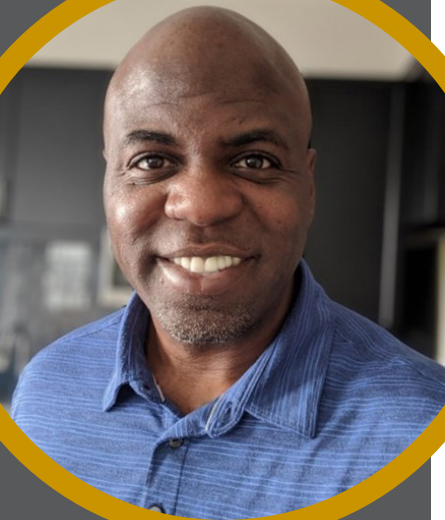
Presenter & Moderator CMSgt, USAF (retired)