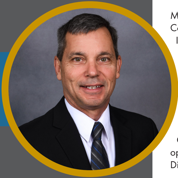
Presenter & Moderator Col, USAF (retired)