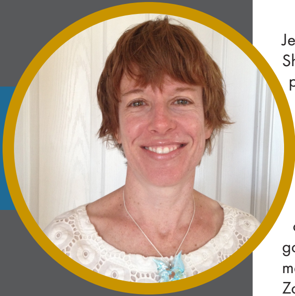
SBCC Support Team Director of Educational Services