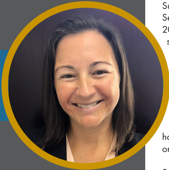
Presenter & Moderator CMSgt, USAF (retired)