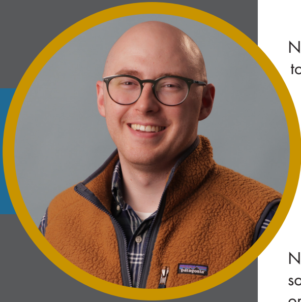
SBCC Support Team IT Specialist, SBCC