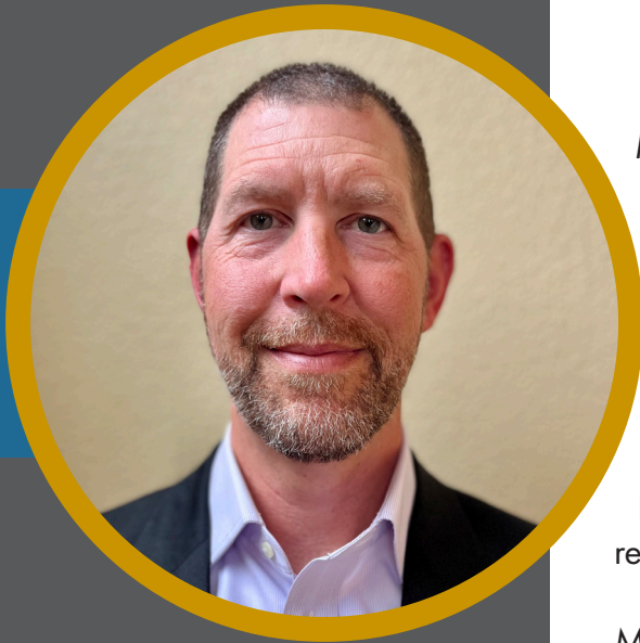
Presenter & Moderator Lt Col, USAF (retired)