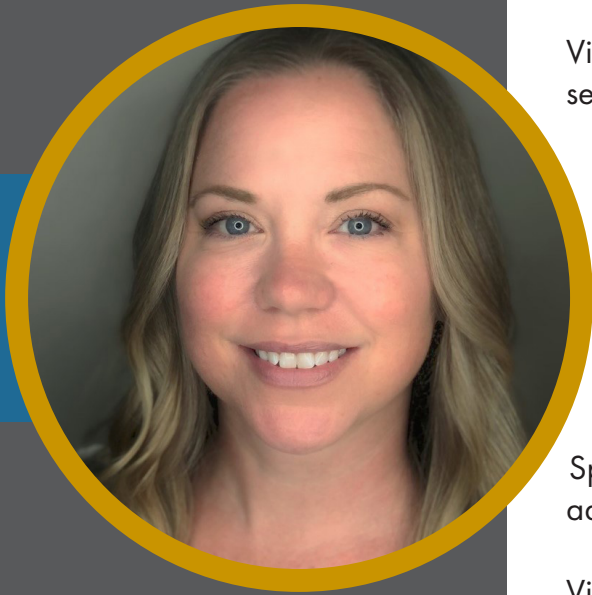
Presenter & Moderator CMSgt, USAF (retired)