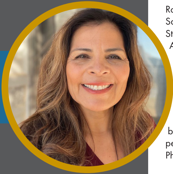
Presenter & Moderator CMSgt, USAF (retired)