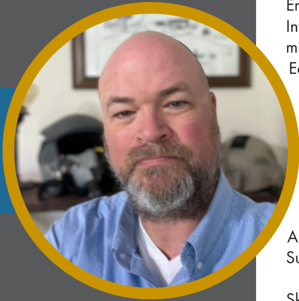
Presenter & Moderator CMSgt, USAF (retired)