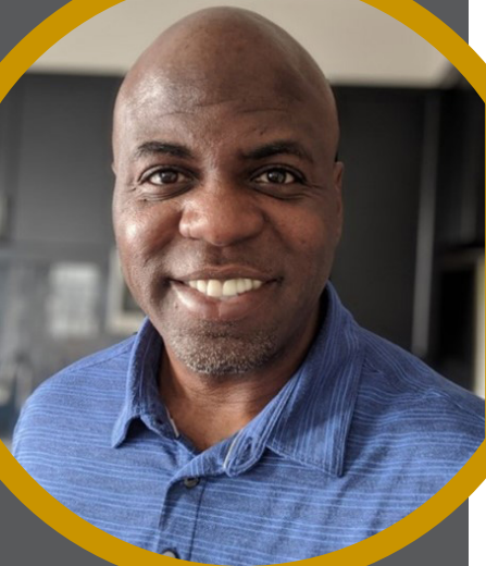
Presenter & Moderator CMSgt, USAF (retired)