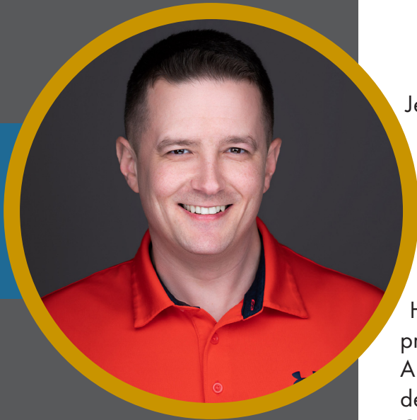
Presenter & Moderator SMSgt, USAF (retired)