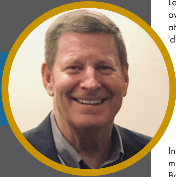
Senior Mentor SBCC Guest Presenter General, USAF (retired)